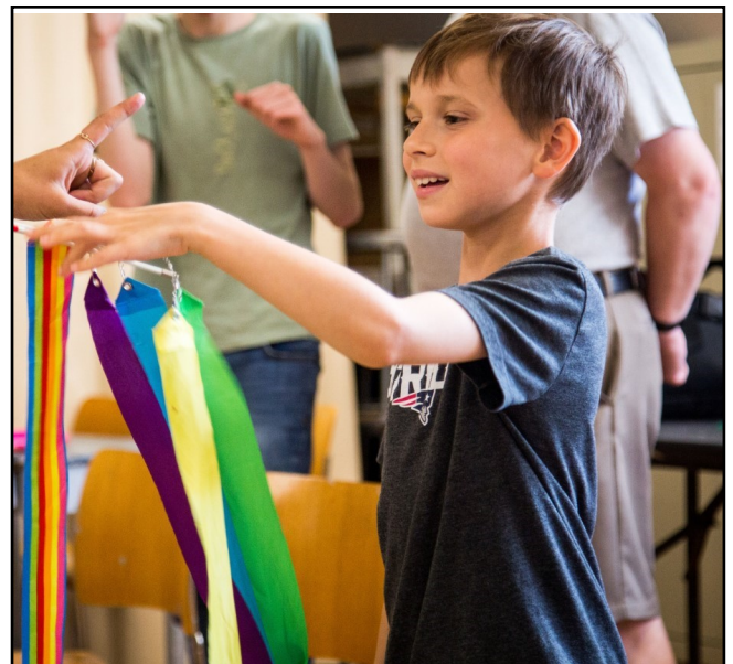
Individualized attention is central to H.A.L.O.'s Swim And Sing programs.

"In that case we invite family members to