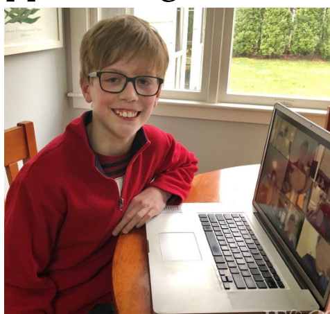
A SibShop participant “zooms” at home.

“We moved both programs to Zoom (a popular video conferencing application)