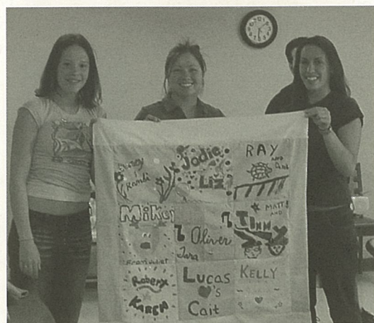
UMass students presented a quilt to their "NoHo" buddies at the end of the semester.