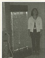
NEPC's simulated waterfall of lights

sounds, sights, smells and tactile experiences.